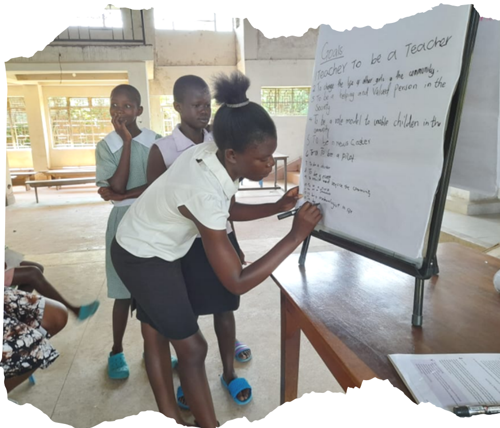
Girls in Homabay Presenting their Future Goals to the Class

375 adolescent girls from the counties of Homabay, Siaya and Vihiga benefited from the TUDAI. The sessions were conducted by the 15 Peer Educators, each entrusted with mentoring 25 girls over a 3 - day period during school holidays. The TUDAI program involved a series of 12 sessions in which adolescents aged 9-18 learn about their sexual and reproductive health and Life Skills. The chart below show the topics covered.