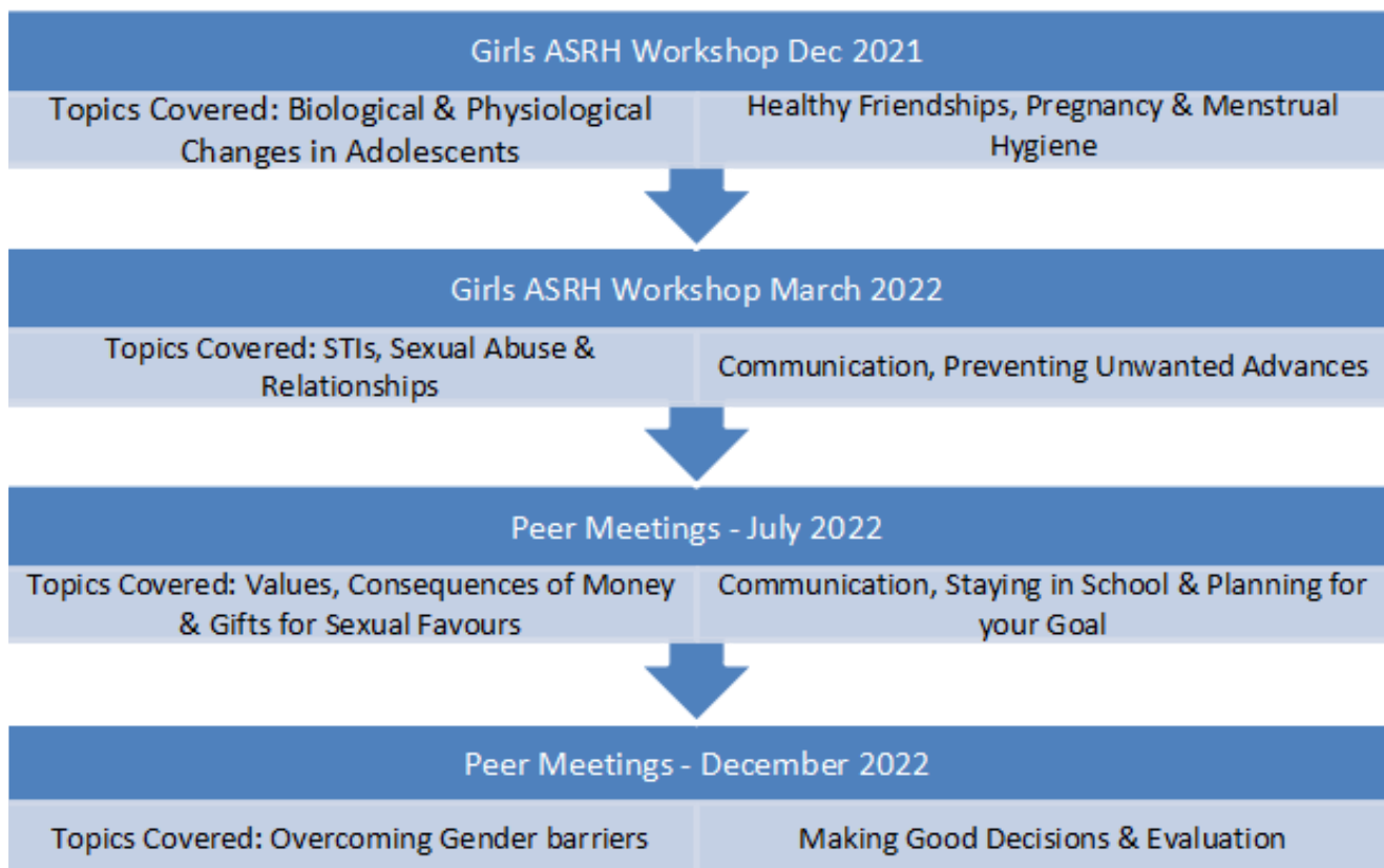
Roadmap of the TUDAI Workshops

To mark the end of the workshops, the adolescent girls were awarded certificates in recognition of their participation in TUDAI.