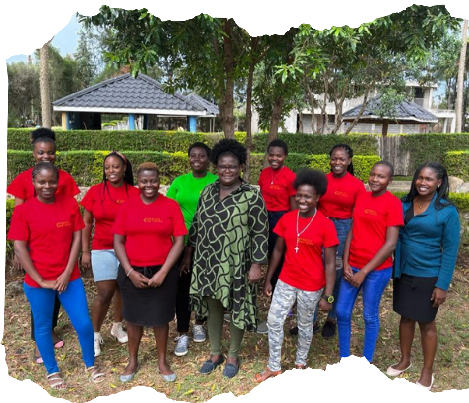
Girls during the April Retreat

The girls' annual retreat was held at Tumaini Cottages and Conference Centre in Nakuru in April 2022. The retreat was organized to bring together the team of girls' beneficiaries under the Pangea Sponsorship Program. The retreat brought together a team of fifteen (15) participants, who included sponsored beneficiaries and Pangea staff. The retreat was facilitated by Pangea staff. Topics covered during the retreat were: soft skills, digital skills, financial literacy, and student resources.